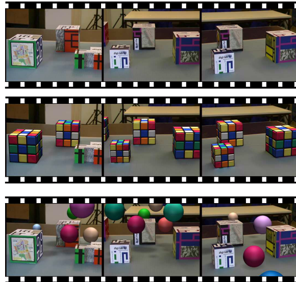
Figure 2. Reconstructed scene containing cubes on a tabletop. First row: original images of the scene. Second row: After modelling the scene, we can convert all cubes to Rubik's cubes. Third row: insertion of synthetic objects into the scene.